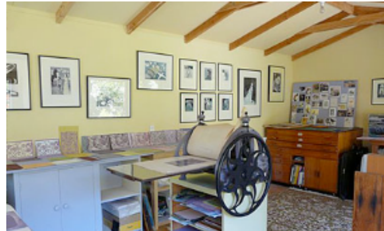
The new etching studio

Remember if you have a group of three or four we can arrange times to suit - during the week as well as on a weekend.