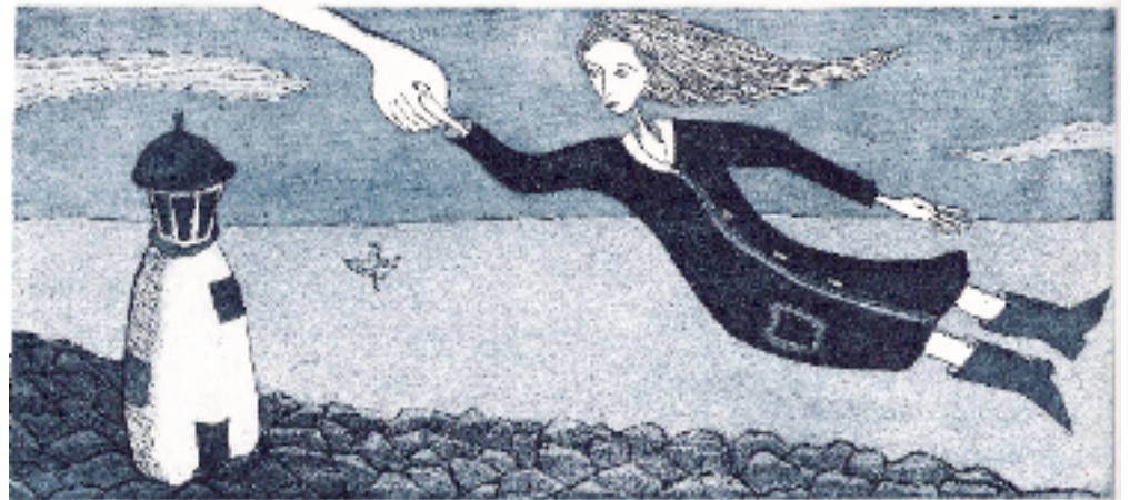
A Leap of Faith

Except the known is predictable, flat and ultimately unsatisfying. It is the unknown, the mysterious, the small winding path off to one side that makes the heart beat faster and leads to hidden treasure.