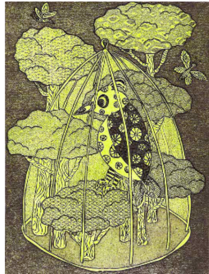
The Invincible Forest

It seemed impossible, however, to explore a bird theme without including caged birds, which were also a common sight in Bali. Archetypally, birds represent both spirit and soul. I am always amazed when a caged bird still sings - a testament to the indomitable spirit and shining soul life that we see in such people as Mandela and Aung sun Sung and others, who speak of peace, justice and tolerance whilst yet imprisoned.