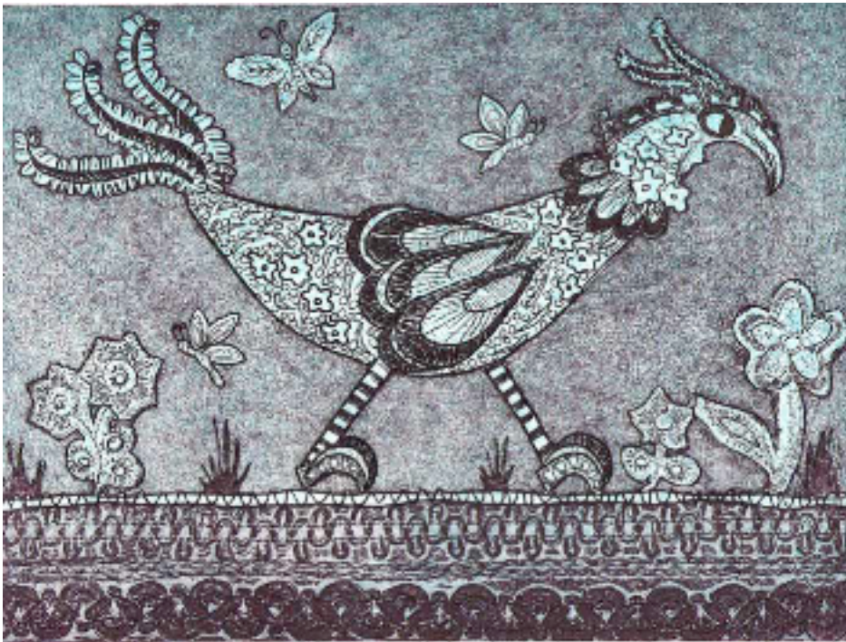
The Lone Rooster

After returning from a holiday in Bali to a cold New Zealand winter full of drab greys and browns I felt such a hunger for the vibrant colours and complex patterns that had so nourished me in Bali it was almost a grief. So I decided to follow a long time love of mine and create a series of quirky bird characters using some of the aesthetic values from traditional balinese painting.